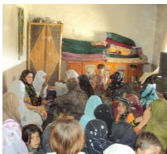
Mobilization in Hanifya Qalacha, Daman district October 2, 2011