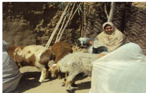
Loan paid to the SG members in Da Ghra kalai, Daman district and the borrower purchased lambs for raising.