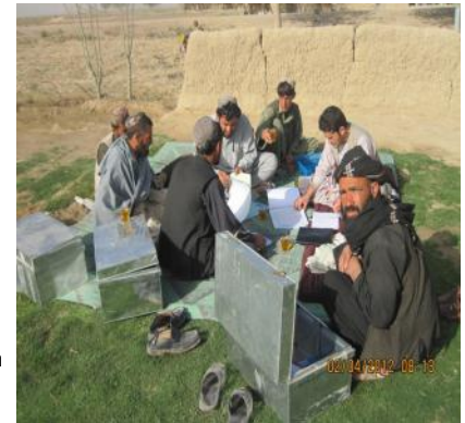
M&E officer during assessment and monitoring process in Haji Mawladad Qalacha,

The initial meeting and mobilizations are under way and soon the Village Saving and Loan Associations would be establish and reflected in upcoming reports.