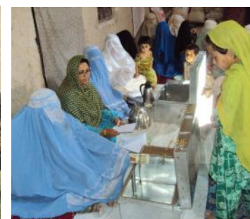
SG formation process in Sor-daig, Arghandab district October 24, 2011