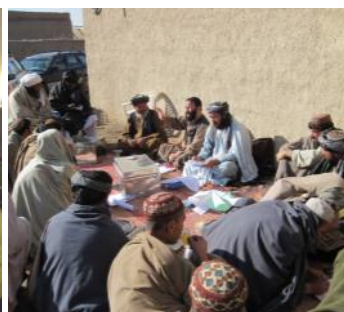
SG formation process in Deh-Ghulaman, Dand district Jan 25, 2012