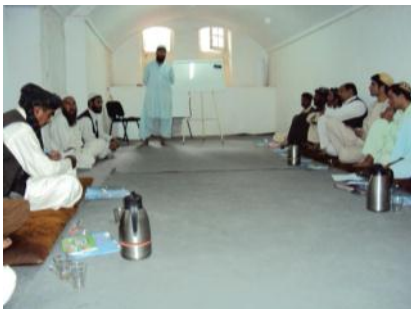
Orientation, SG formation and book keeping training for fresh VFs November 10, 2011 AICB office