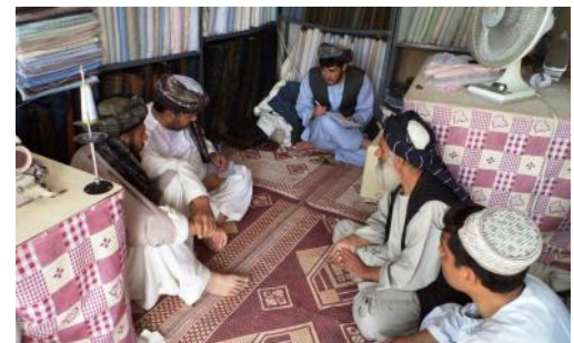
Cloth retailing shop launched in Ba Ba sahib Langar, Arghandab districts on May 15, 2012 after the loan disbursement process.